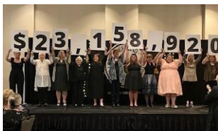
Shout out for what ESA did for St. Jude Hospital